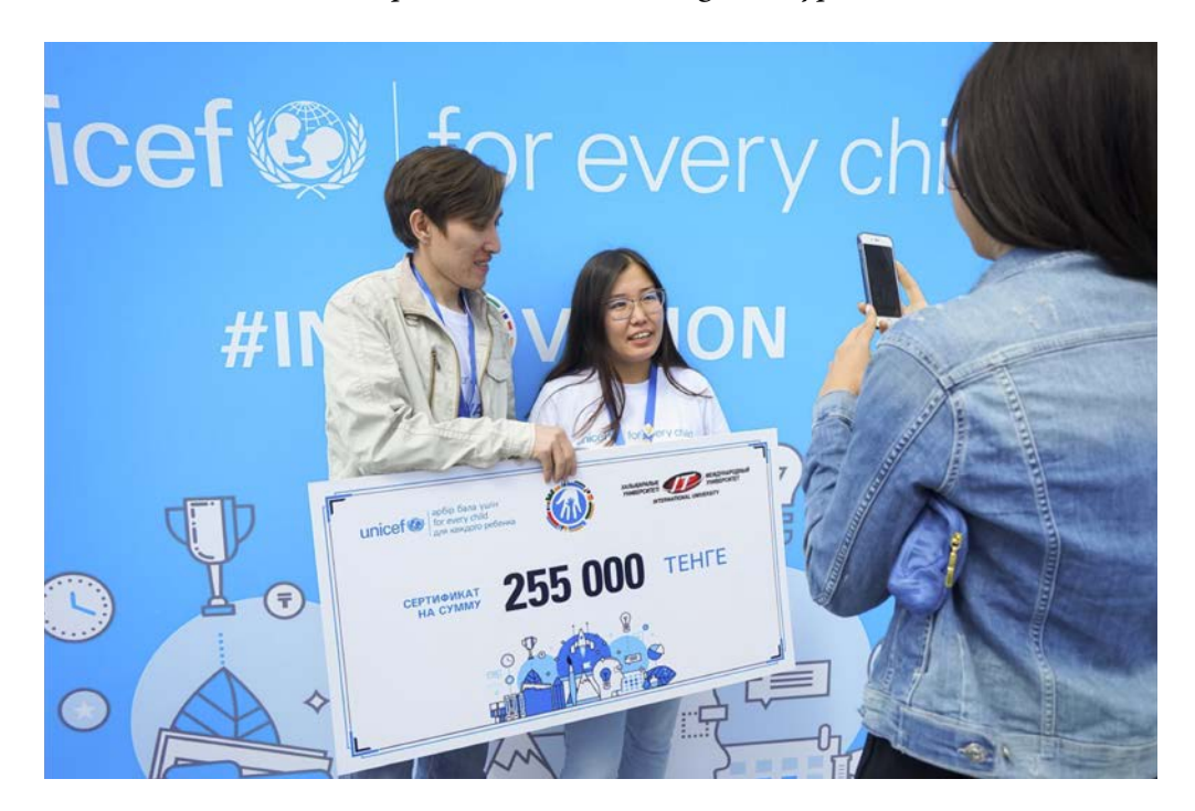
UN-chained: Experiments and Learnings in Crypto at UNICEF

UNICEF Hackathon in Astana Kazakhstan, 2017